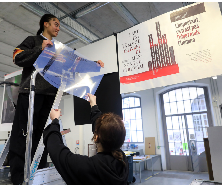
Publishing workshop