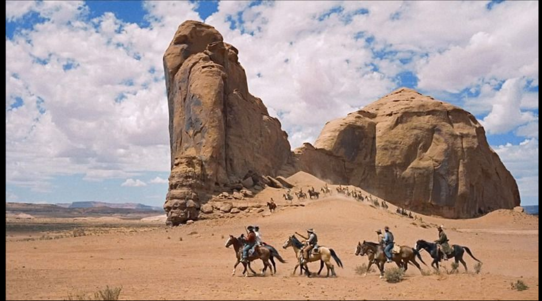
John Ford: The Searchers , 1956