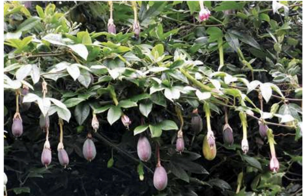
Banana passionfruit - one of the Dirty Dozen weeds

New Zealanders will be encouraged to roll up their sleeves and join forces to fight against invasive weeds in a new campaign launched today by Conservation Minister Maggie Barry.