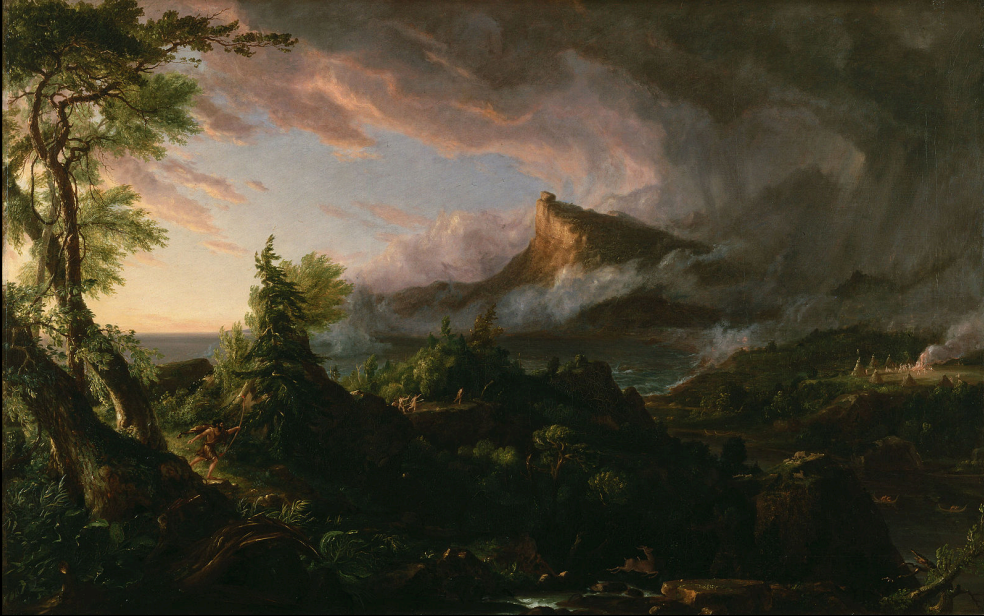
Thomas Cole, The Course of Empire, The Savage State . 1836