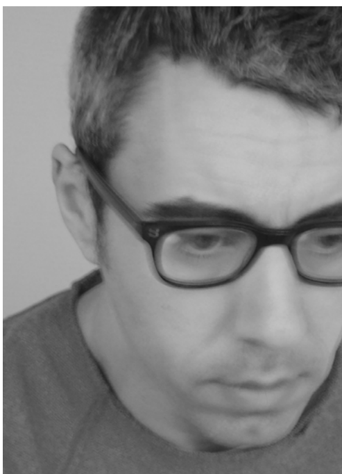
Portrait DD, Crédits photographiques : Cécile Bortoletti

Offering a retrospective overview of his career, the exhibition he is presenting at the Cité du design will bring together several pieces in the same space: pieces that were self-produced or produced for galleries, but also pieces developed as part of scenography commissions or for monographic exhibitions. Intended as an installation in its own right, it will embrace different types of interventions, practices and productions, in a cross-cutting approach. The objects will be accompanied by archive documents, mainly presented in the form of collage-type visuals or scrapbooks. To initiate a spatial dialogue between the objects on display, this exhibition will also incorporate sound and film, with the aim of experimenting with a specific staging/spatialisation.