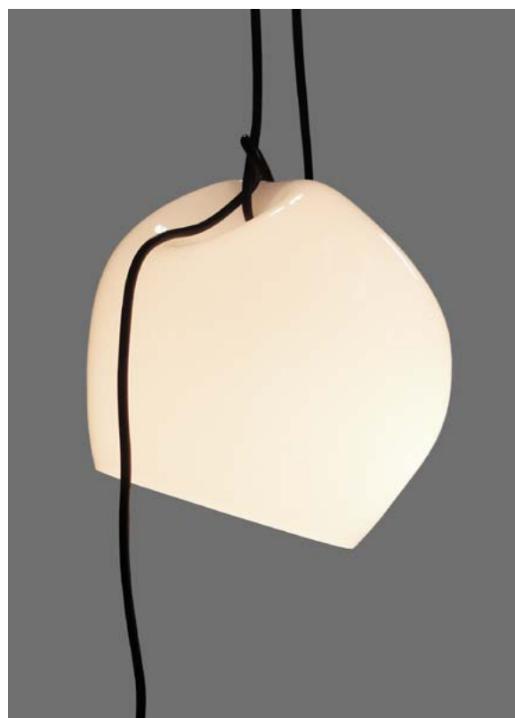
Mobile #1, 2014 Luminaire, suspension Edition CIRVA, Marseille