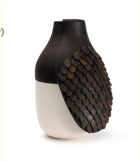
Studio Formafantasma, Vase Botanica 12, 2011 FNAC 2015-0066 (1 to 3) Centre National des Arts Plastiques collection

The CNAP is a public institution that plays a central role in the visual arts field and contributes to the vitality of the French art scene. It enriches and conserves the national collection on behalf of the State and makes it available to the public through temporary and permanent loans in France and abroad. It has a design collection of almost 12,000 pieces created by over 2,200 French and foreign designers. Covering a wide range of periods, countries, production methods and practices, it reflects the vitality and plurality of contemporary design. The CNAP is a founder member of the Galerie Nationale du Design. As such, it makes its collection and its expertise available to curators and contributes to the strategic education and facilitation plan.