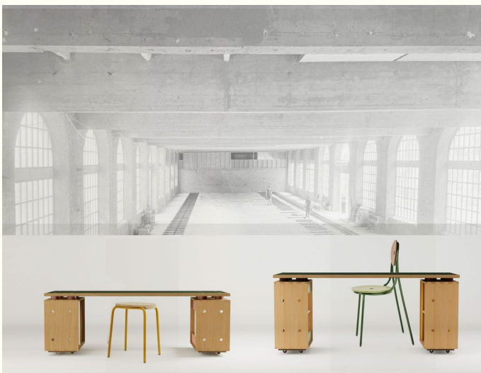
Furniture for La Mezzanine at the Galerie nationale du design