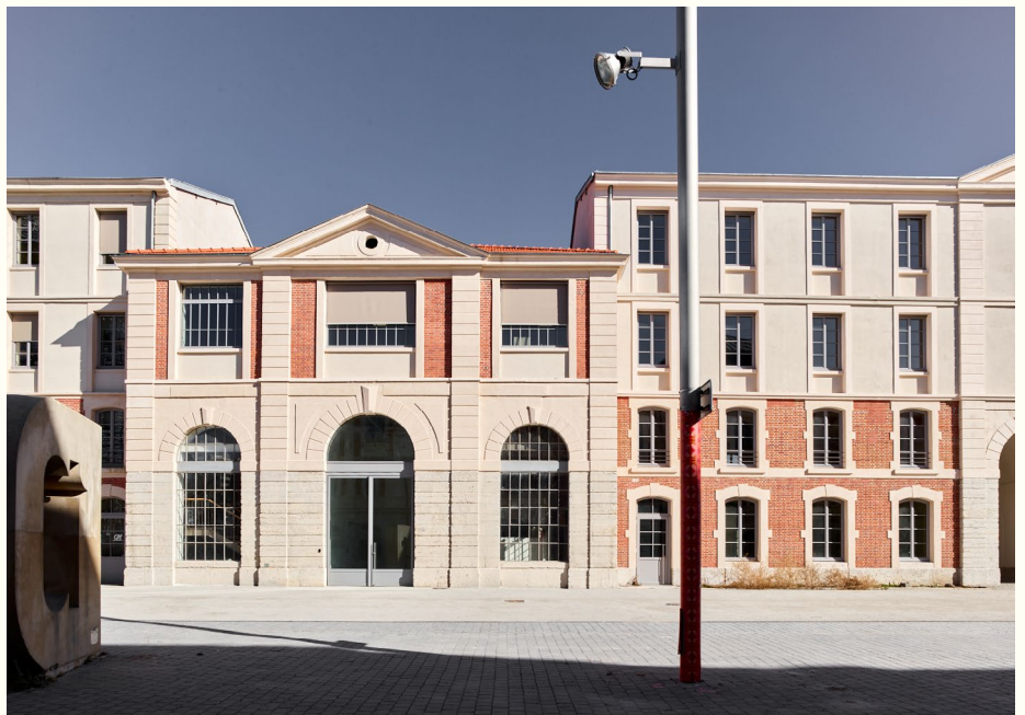
Galerie Nationale du Design, Cité du design quarter, Saint-Étienne

The Galerie nationale du design brings together in one special place works representing the breadth and diversity of France's public design collections. It will offer the public a fresh perspective and a common narrative on an exceptional heritage. Designed to be an open, living place where design can be explored, shared and appreciated by all, and where everyone can discover the diversity of the forms and uses that shape our everyday lives over time, the Galerie nationale du design will be an ideal showcase for these collective assets, with its 1,000 sqm of exhibition, facilitation and experimentation spaces.