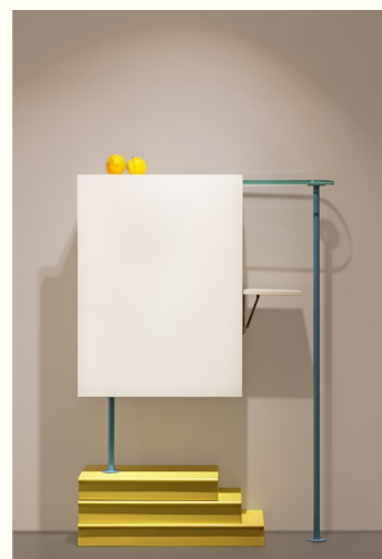
Andrea Branzi, Bar Milano , édition Alchimia, 1979 MADD Bordeaux collection

The MADD will be reopening in April 2026 after undergoing major modernisation work. Situated in the heart of Bordeaux, it is housed in what was a private mansion and an old prison, both listed buildings. Its collections reflect decorative art and design product in the Western world, with examples of tableware, furniture, weapons and also items representative of new uses. The MADD's aim is to promote the art and craft trades, know-how and design in all its forms, but it also tackles the main contemporary issues with a particular focus on eco-responsibility, inclusion and community engagement.