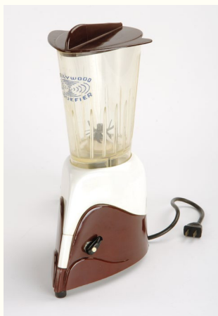
Don E. Grove, Jackson Comstock Hollywood Liquefier Model 48 , c. 1948 Musée d'Art Moderne et Contemporain de Saint-Étienne Métropole

Pedro Friedeberg, Chair , 1961 FNAC 1954 Centre National des Arts Plastiques collection