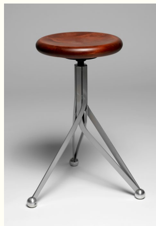
Ron Arad, Anonymous Stool, 1994. Donated by Zeus in 2009 Centre Pompidou, Paris Musée National d'Art Moderne-Centre de Création Industrielle