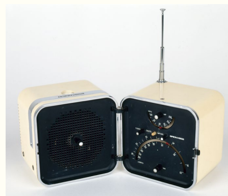
Richard Sapper, Marco Zanuso, Radio TS 502 , 1964 Musée d'Art Moderne et Contemporain de Saint-Étienne Métropole © Richard Sapper © Marco Zanuso

The Musée d'Art Moderne et Contemporain de Saint-Étienne Métropole, also known as MAMC+ opened in 1987 and was France's first regional modern art museum. The design collection, begun when the museum was founded, now includes more than 2,000 objects as well as 600 drawings and models. Inspired by the city's history, its main focus is industrial design and objects intended for mass production. It has collections of the work of four designers: Michel Mortier, René-Jean Caillette, Studio Totem, Savinel & Rozé. The museum has put on 27 different design exhibitions since the end of the 1980s.