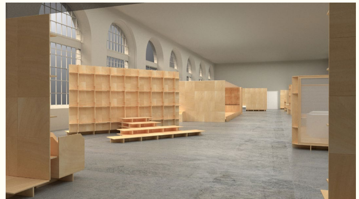
Scenographic items © Éric Benqué

The Galerie nationale du design is housed in one of the buildings of the old Manufacture d'Armes, whose refurbishment was entrusted by Saint-Étienne Métropole to architecture firm SILT and scenography and museum design specialists dUCKS Scéno. Amplifying the original industrial architecture whilst adapting it to new uses, the project is designed around the creation of modular spaces and includes a large exhibition hall. This approach encompasses a clear commitment to OSR: selection of sustainable materials, reduced energy bills and scenography materials eco-designed by Eric Benqué (working with graphic artists Atelier Pentagon), 50% of which will be reused from one exhibition to another.