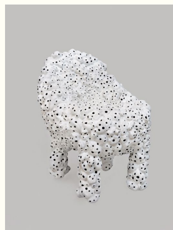
Marlène Huissoud, The chair , 2019, Unfired clay, natural binders and wood FRAC Grand Large-Hauts-de-France collection © Adagp, Paris.

The FRAC Grand Large-Hauts-de-France holds large collections of photographs and installation works, and is the only FRAC (Regional contemporary art collection) to have an active policy of acquiring design works. Its internationally recognised collection of icons of European design covering the period from the 1960s to the present day expresses an acute awareness of our social, economic and ecological context.