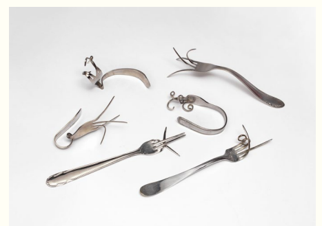
Bruno Munari, Forchette parlanti, 1958 Purchase made thanks to the Friends of the Centre Pompidou, Groupe d'Acquisition pour le Design, 2016 Centre Pompidou, Paris Musée National d'Art Moderne-Centre de Création Industrielle

The Centre Pompidou's design collection consists of some 10,000 works by almost 900 designers, dating from the beginning of the 20th century to the present day, which retrace the steps of the designers that made the history of modernity. It therefore went without saying that the Centre Pompidou would play a part in the opening of the Galerie nationale du design in Saint-Étienne as an exceptional partner, alongside other major cultural institutions.